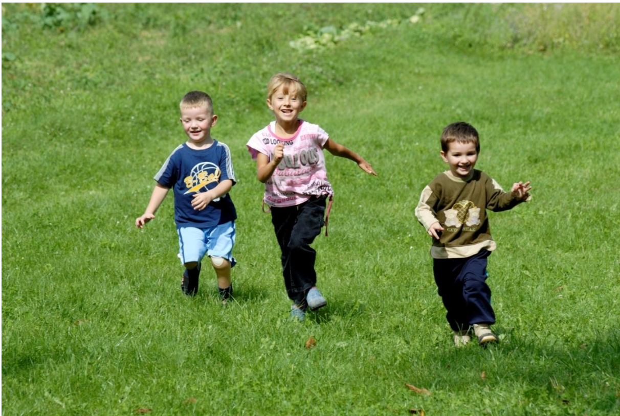
With Friends Again, Bosnia and Herzegovina © Paul Jeffrey, September 2006

Donors: Swiss Federal Department of Foreign Affairs, Ministry of Foreign Affairs of Norway, Australian Government's Overseas Aid Programme (AusAID).